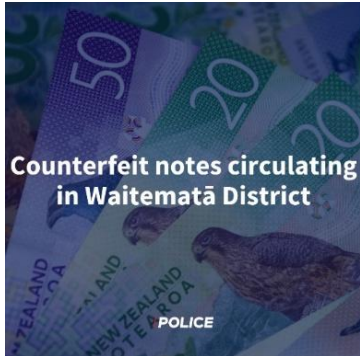
Counterfeit notes circulating in Waitematā District