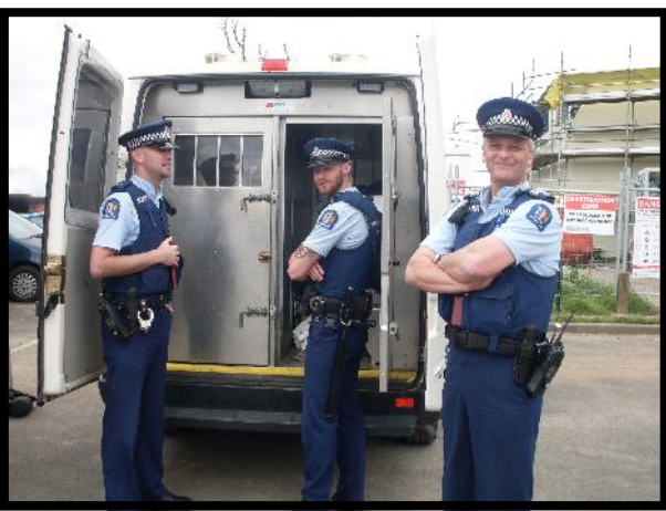
Police at Starling Park Safer Ranui Event.

This day could not have happened without the above agencies and volunteers, who turned up to help at the event, along with the residents of Ranui who turned up to support making their Park and Community Safe.